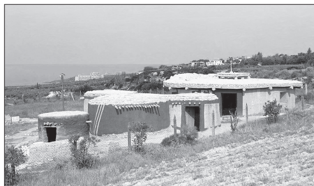
■ Fig. 2 General view of the Lemba Experimental Village, Cyprus from the south. Image from: Thomas 2005 fig. 1.3, p. 11.

Images (1997, 2) describes how “images become arresting because they are phrased in the language of the visual, a language which is ascribed a greater degree of immediacy, comprehensibility and believability than the Western, particularly the scientific, tradition” He sees images as being central to the way in which knowledge is both constructed and expressed to the extent that concepts, even within the pure sciences, are restricted in the absence of visualisation (Molyneux 1997, 6). If images can be so fundamental to the workings of science then it is also important that we too understand what we are actually doing when we create these images of the past and that we understand how images are used by those with whom