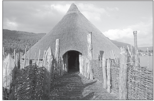
■ Fig. 4 The Scottish Crannog Centre, Loch Tay, Scotland.

All these devices are designed to make the viewer feel less at ease with the drawing or the building and to feel that they are in the presence of an academic considered piece of work. To a very large extent, they succeed. We should also consider Swogger's admonition of avoiding the tyranny of representation implicit in single interpretations by providing a multiplicity of interpretations - easily done with drawings but not so with experimental reconstructions where considerations of cost, space and time bear heavily upon the undertaking.