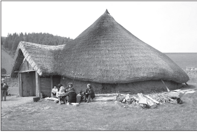
■ Fig. 3 The great Roundhouse at The Butser Experimental Farm, Hampshire, England.